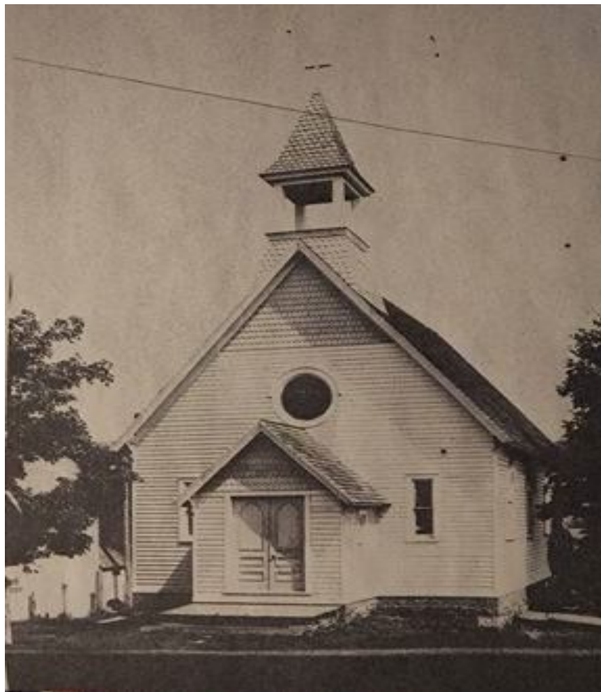
St. Monica's Roman Catholic Church—Sussex Borough—1900